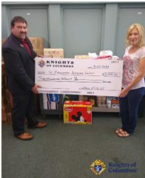
The Wisconsin Knights of Columbus thanks St Francesca Resource Center, Chippewa Falls for applying for a 2020 State Culture of Life Grant Fund.

Culture of Life Grant Fund. This year the State provided numerous Pro-Life agencies throughout the state grants totaling over $105K to help fulfill their mission – cultivating a culture of life.