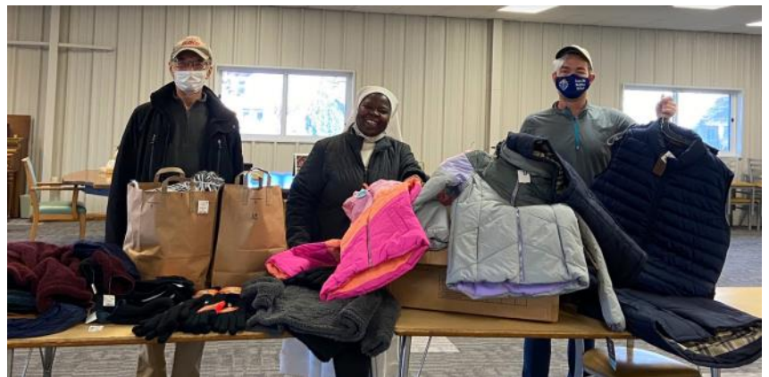
Coats for Kids Event in Milwaukee ArchDiocese