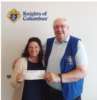
The Wisconsin Knights of Columbus thanks Seed of Hope Center, West Bend for applying for a 2020 State Culture of Life Grant Fund.