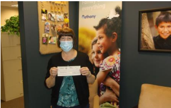
Staff from Behany Christian Services of Wisconsin in Waukesha receives and thanks the Knights for the $3400 check (Culture of Life Grant) during October Respect Life Month.

Culture of Life Grant Fund. This year the State provided numerous Pro-Life agencies throughout the state grants totaling over $105K to help fulfill their mission – cultivating a culture of life.